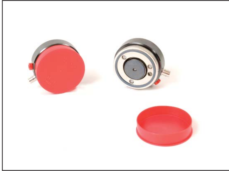
Figure 1: PRF-911 with protective cap