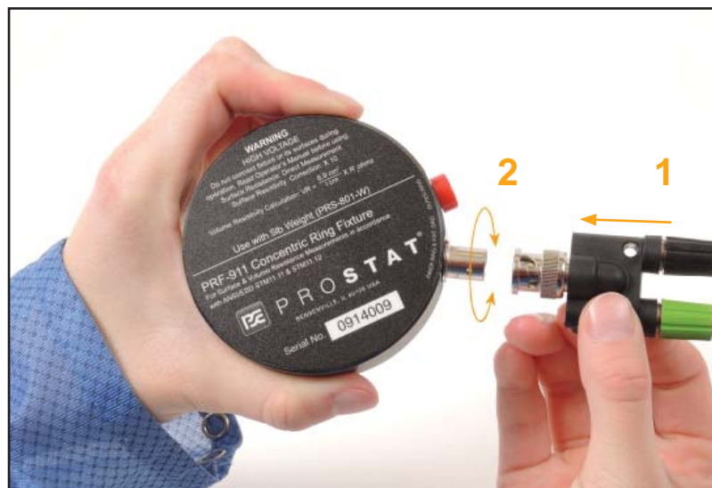
Figure 4: Installing the BNC Adapter