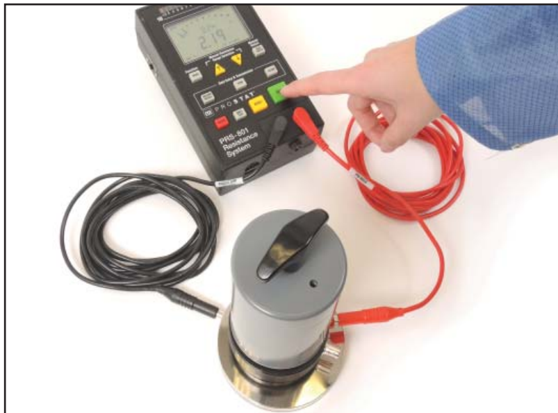
Figure 9: Confirming Electrode Contact to Test Bed