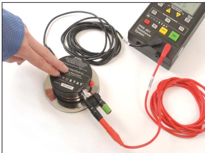
Figure 8: Confirming Electrode Contact to Test Bed