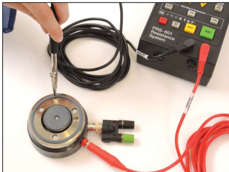
Figure 7: Confirming Outer Electrode