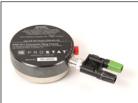
Figure 2: BNC adapter and connection