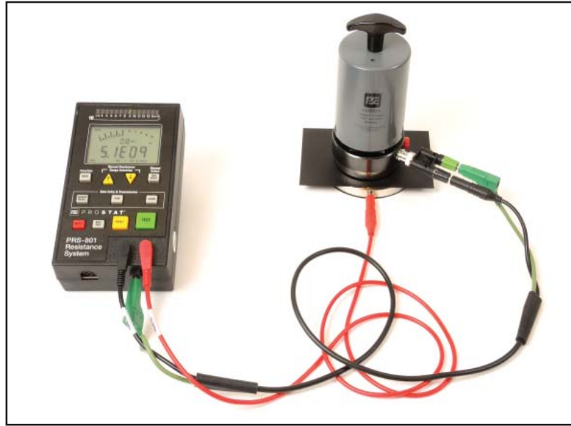
Figure 11: Fixture Preparation (Continued from Fig. 10)