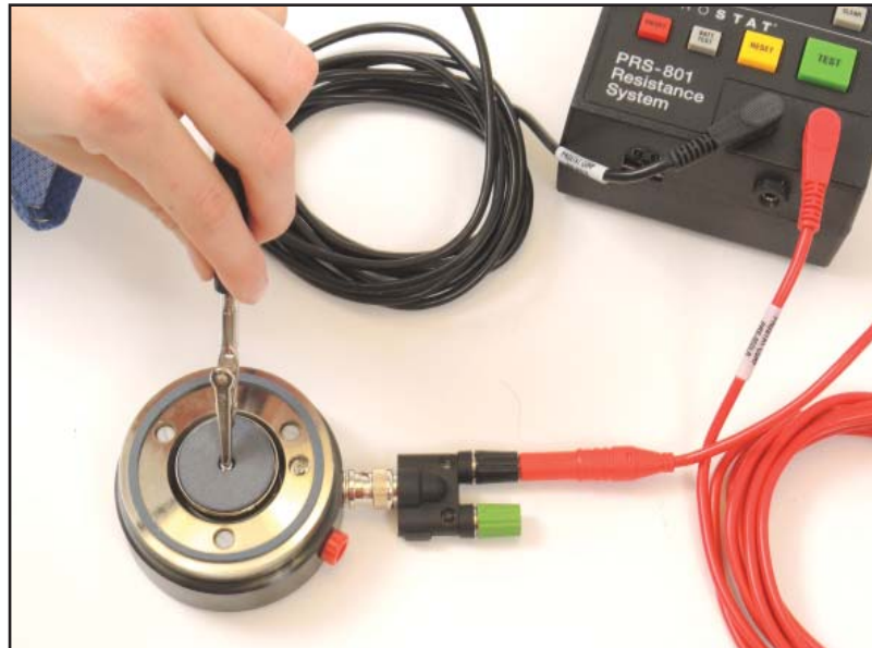
Figure 6: Confirming Center Electrode