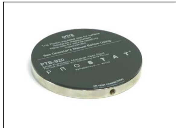
Figure 3: PTB-920 Dual Test Bed