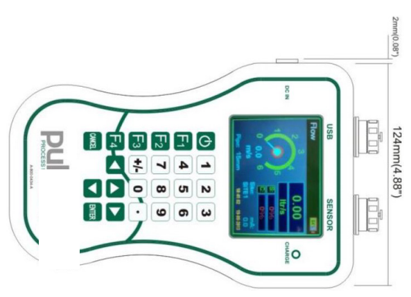
Flow Pulse HandHeld Controller Front Drawing