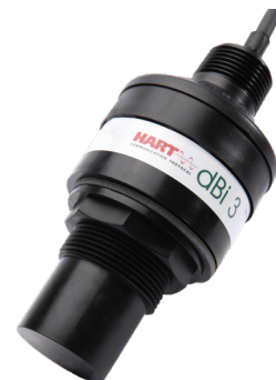
dB i 3 HART Threaded Nose and PVDF Face

The first boot is approximately 8 seconds, if a typical 15-minute boot interval is used, this becomes approximately 3.5 seconds. The dB i transducers with HART will convert level to volume, and includes a library of typical tank shapes or a 16-point curve fit.