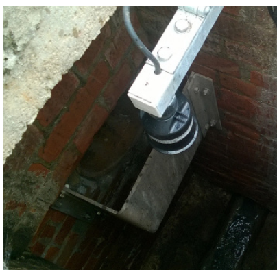
dB i HART on a CSO Application

The dB i HART Transducer series features Pulsar Measurement's world-leading echo processing software, Digital Adaptive Tracking of Echo Movement (DATEM). DATEM software allows the system to zero in on the echo from the true target and follow it as it moves up and down the vessel, ignoring the stationary echoes from other elements in the measurement path. Stanchions, chains, and ladders, which cause many ultrasonic systems to fail, are no barrier to Pulsar Measurement equipment. This allows the dB i HART transducers to give reliable and accurate measurement in applications where other manufacturer's equipment would not work.