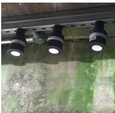
3 dB i HART transducers Monitoring Sludge Levels