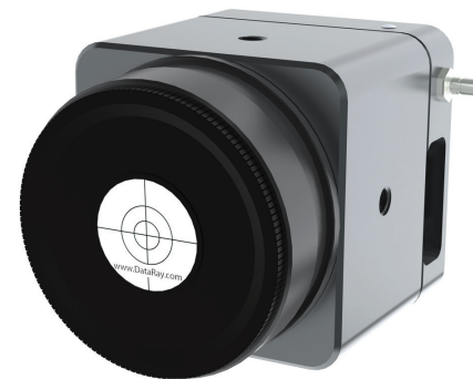
TaperCamD-LCM 2.25 x 2.25 x 2.13 in 57 x 57 x 54 mm

The TaperCamD-LCM is paired with DataRay's full-featured, highly customizable, user-centric software (which has no license fees, unlimited installations, and free software updates). It is perfect for applications including: CW and pulsed laser profiling; field servicing of laser systems; optical assembly; instrument alignment; beam wander and logging; R&D; OEM integration; and quality control.