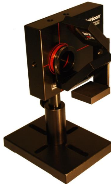
With additional 45 deg beam splitter (P/N SPZ17026 mounted to give 20x20=400 X attenuation

The wedge beam splitter attachments for C-mount cameras allow you to measure laser powers up to ~400 Watts. The beam splitter wedge is so designed as to reflect the oncoming beam from the front surface of the wedge at 90 degrees into the camera. The reflection from the rear surface is reflected at such an angle that the rear surface reflectance will miss the camera and not be seen. Approximately 90% of the beam is transmitted through each beam splitter wedge with 5% passed onto the camera (or second wedge) and another 5% diverted by the wedged surface.