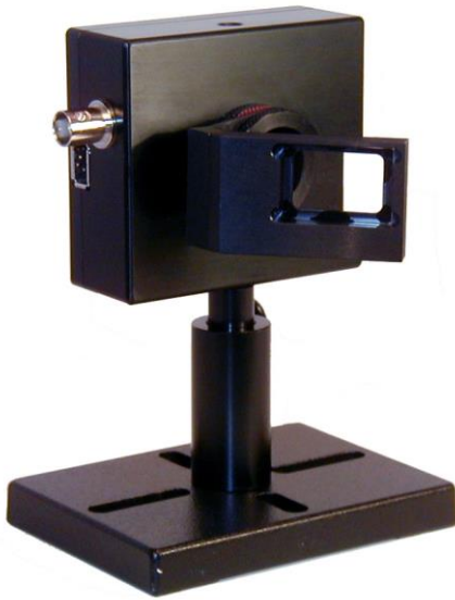
45 deg beam splitter P/N SPZ17015 as provided to give 20X attenuation.