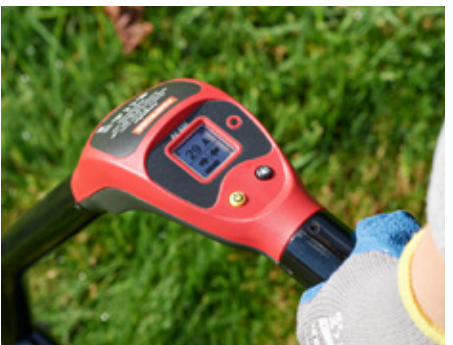
Clearly view the LCD display in bright sunlight