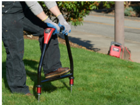
Pinpoint fault location by using the AF-600 with the UAT-600 Transmitter