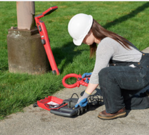
The Transmitter will automatically change modes based on which accessory is plugged in