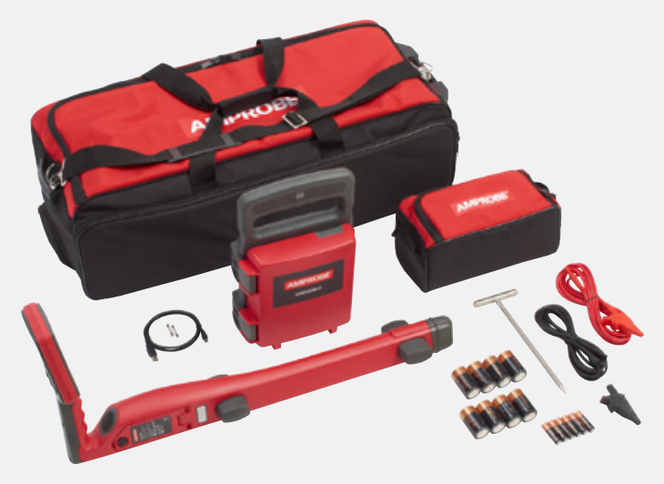
UAT-610 Underground Utilities Locator Kit