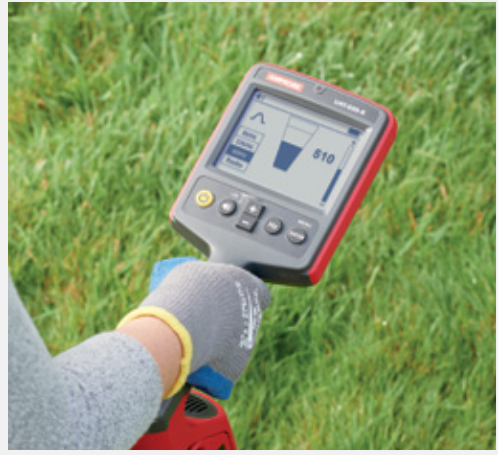
The Receiver's high contrast LED screen is easy to read in full sunlight