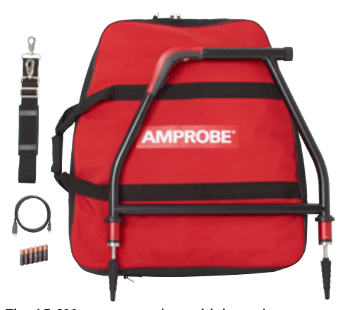
The AF-600 comes complete with batteries and a carrying case