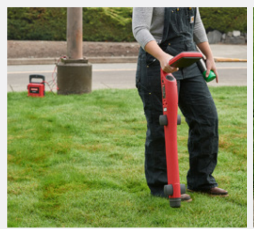
Trace an individual utility by connecting the transmitter directly with the test leads