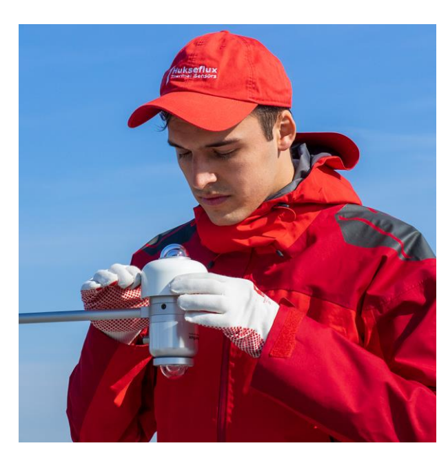
Figure 5 using SRA30 albedometer is easy; the instrument is composed of AMF03 and two SR30-M2-D1 pyranometers