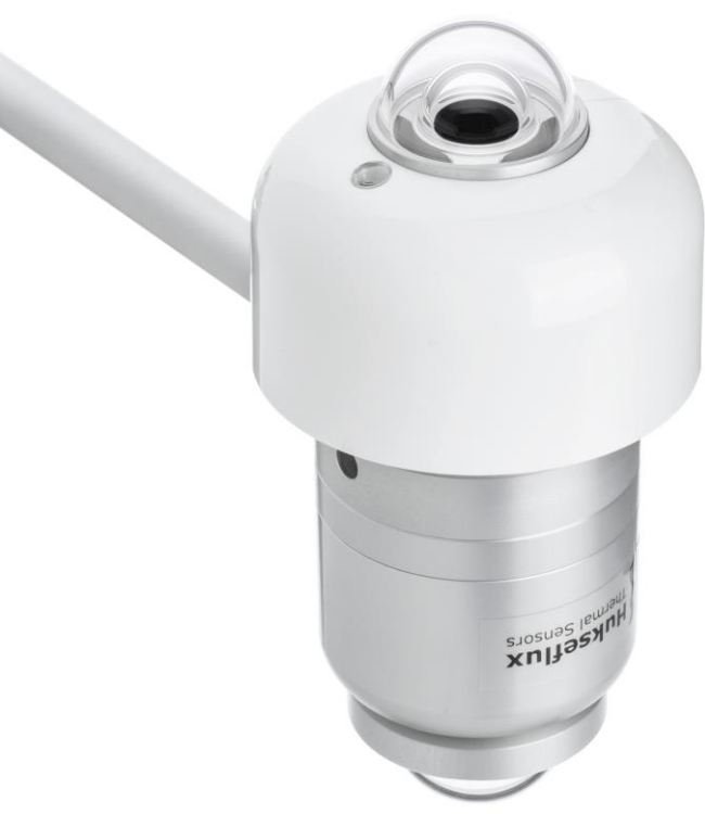
Figure 1 SRA30-M2-D1 albedometer

SRA30-D1 digital spectrally flat Class A albedometer is an instrument that measures global and reflected solar radiation and the solar albedo, or solar reflectance. SRA30-M2-D1 is the most accurate albedometer available, and heated for the best data availability. It is composed of one AMF03 albedometer mounting kit and two SR30-M2-D1 spectrally flat Class A (previously "secondary standard") pyranometers. This pyranometer is compliant in its standard configuration with the requirements for Class A PV monitoring systems of the IEC 61724-1:2017 standard. Each pyranometer has a thermopile sensor, the upfacing one measuring global solar radiation, the downfacing one measuring reflected solar radiation. AMF03 includes one glare screen, one mounting fixture with rod, mounting hardware and tools. SRA30 complies with the latest ISO and WMO standards. The modular design facilitates maintenance and calibration.