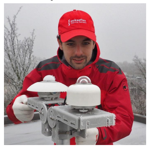
Figure 2 frost and dew deposition: clear difference between a non-heated pyranometer (back) and SR30 with RVH™ technology (front)