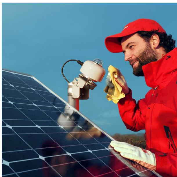
Figure 2 SR15 pyranometer mounted in PoA (Plane Of Array) on a mast for PV performance monitoring