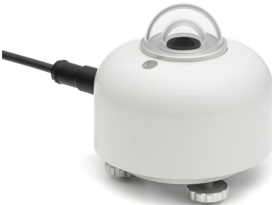
Figure 1 SR15 spectrally flat Class B pyranometer series

SR15 pyranometer series is a range of high-accuracy solar radiation sensors. It is "spectrally flat Class B", according to the ISO 9060:2018 standard and WMO guide. Various outputs are available, both digital and analogue. Versions SR15-D1 and SR15-A1 are equipped with an on-board heater, mitigating dew and frost.