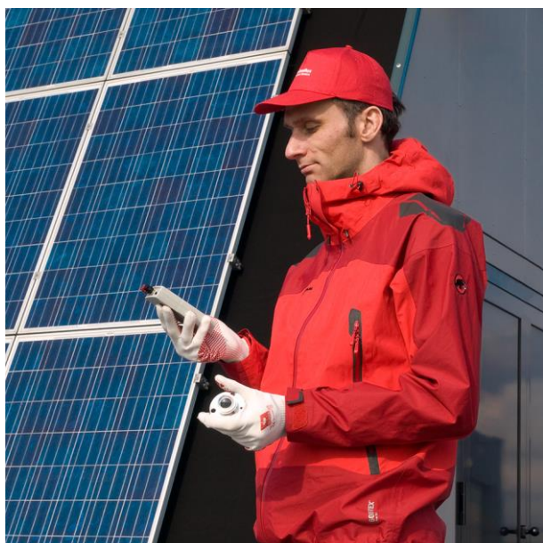
Figure 4 LI19 used with a pyranometer in a field measurement campaign