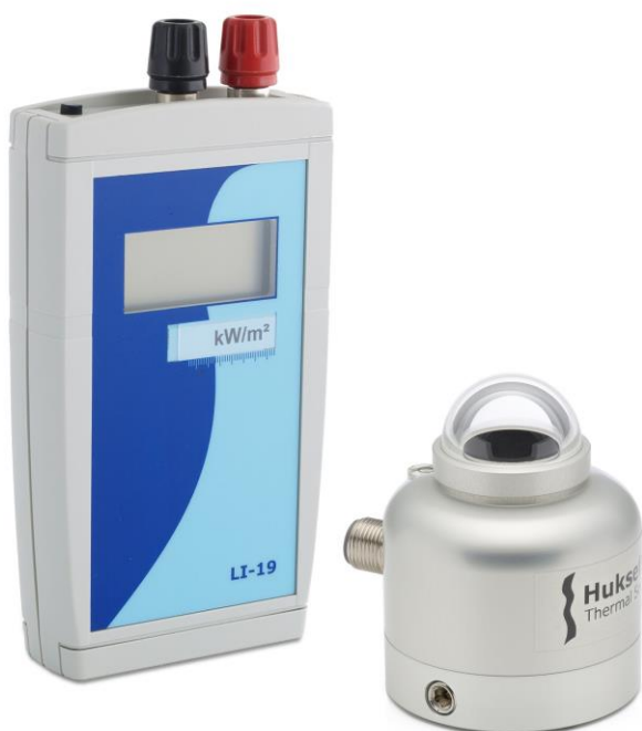
Figure 1 SR05-A1 pyranometer with LI19 handheld read-out unit / datalogger

SR05 is a solar radiation sensor that is applied in most common solar radiation observations. SR05-A1, with analogue millivolt output, complies with the spectrally flat Class C specifications of the ISO 9060 standard and the WMO Guide. LI19 is a high-accuracy handheld read-out unit / datalogger. The SR05-LI19 combination is well suited for mobile measurements and short term datalogging.