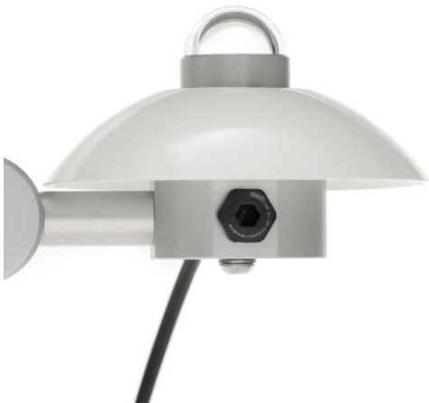
Figure 4 RA01 2-component radiometer in detail: pyranometer model SR01

Applicable instrument-classification standards are ISO 9060 and WMO-No.-8; Guide to Meteorological Instruments and Methods of Observation.