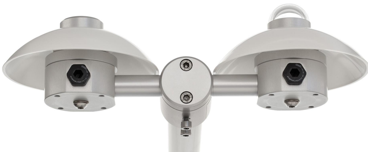
Figure 1 RA01 2-component radiometer

RA01 is a market leading 2-component radiometer, mostly used in scientific-grade energy balance and surface flux studies. It offers 2 separate measurements of solar and longwave radiation. Product features include a modular design, low weight, and easy levelling, and low solar offsets in the longwave measurement. The unique capability to heat the pyrgeometer reduces measurement errors caused by dew deposition. When combined with estimates of solar albedo and of local surface temperature, this instrument can also be used for estimation of net radiation. The advantages of this approach are cost reduction and independence from local surface properties.