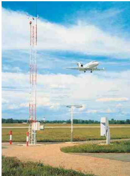
The PWD22 is recommended for Automatic Weather Observation Systems (AWOS).