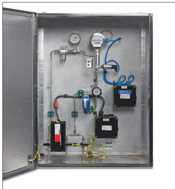
Promet I.S. Sampling system

A minimalist approach to the sampling system design is essential to ensure best dynamic response to process moisture variations. A particulate filter and isolation valve are the only components prior to the sensor.