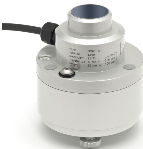
Figure 1 IR02-TR pyrgeometer with heater and 4-20 mA transmitter

IR02-TR is a pyrgeometer suitable for longwave irradiance measurement in meteorological applications. The instrument can be heated, which improves measurement accuracy as it prevents dew deposition on its window. IR02-TR houses a 4-20 mA transmitter for easy read-out by dataloggers commonly used in the industry.