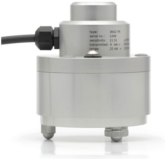
Figure 3 IR02-TR with heater and 4-20 mA transmitter