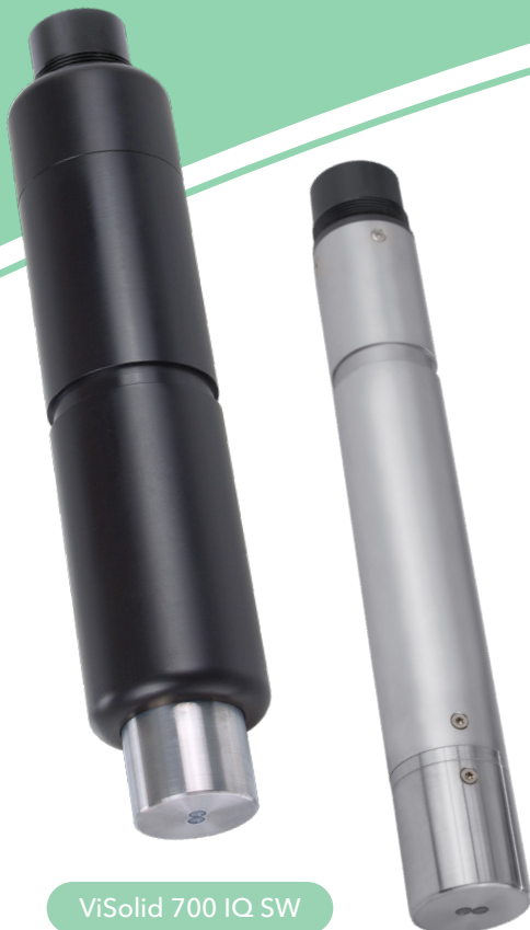
ViSolid 700 IQ SW

OPTICAL TOTAL SUSPENDED SOLIDS SENSOR FOR IQ SENSORNET