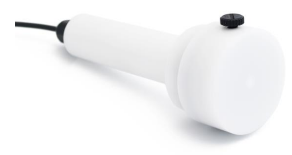
Figure 4 HF03 with its protection cap