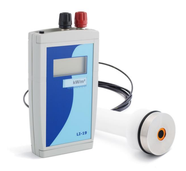
Figure 1 HF03-LI19 portable heat flux sensor with read-out unit / datalogger

HF03 is a heat flux sensor that is applied in mobile measurements. It is combined with LI19, a high accuracy handheld read-out unit / datalogger. The combination HF03- LI19 is typically used to study heat flux levels of flares and fires, and to verify the performance of permanently installed flare radiation monitors and flare heat flux sensors.