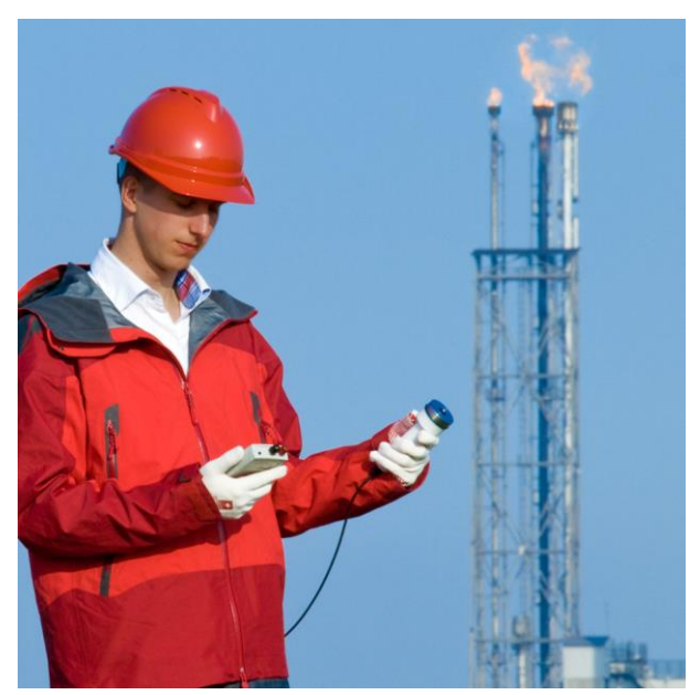
Figure 2 We offer an extensive range of products for fire testing and studies of flares. The picture shows HF03-LI19 portable heat flux sensor with read-out unit.