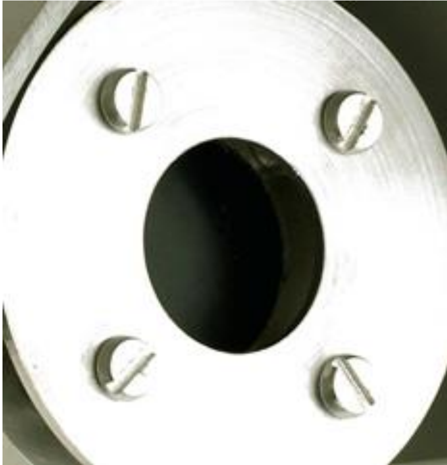
Figure 6.1.1 Picture of HF02's sensor surface. The sensor surface should be inspected on a weekly basis. The picture shows that the sensor field of view is unobstructed, and that the sensor surface is not scratched and that it is clean.