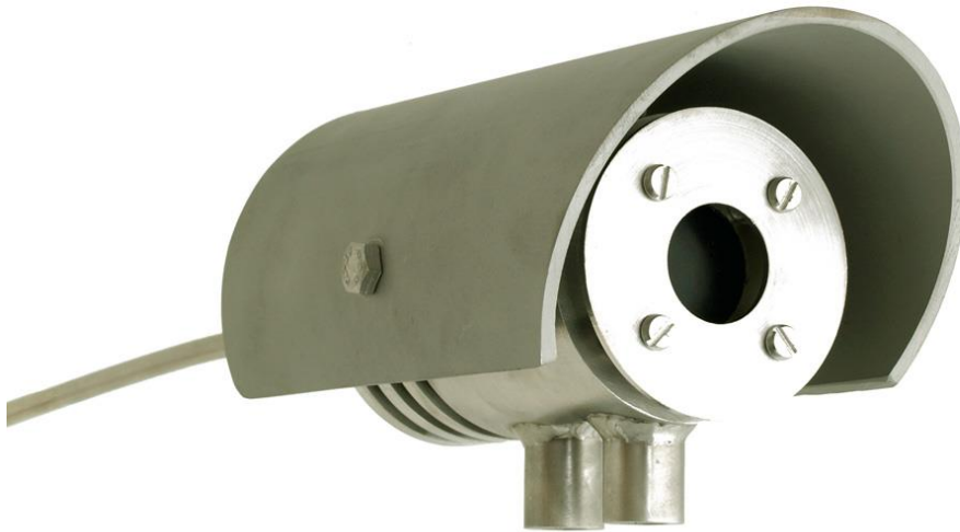
Figure 0.1 HF02. Standard cable length is 3 m high temperature metal sheathed cable plus 3 m low temperature extension cable.

HF02 should be regularly inspected. The sensor performance can be verified by comparison to a portable heat flux sensor such as model HF03 .