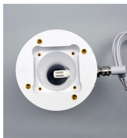
EE08 mounted inside TS-100 fan-aspirated radiation shield.