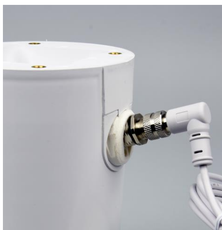
EE08 custom port adapter inside TS-100 fan-aspirated radiation shield.