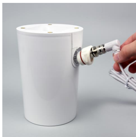
Push the EE08 into adapter port.