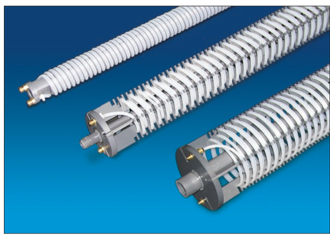
1.8", 3.8" & 5.8" Waterloo Emitters