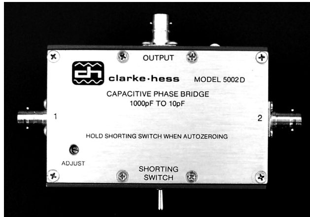
Figure 1. Capacitive Phase Verification Bridge

Figure1 illustrates the physical construction of one of the four bridges.