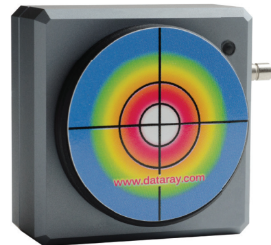
WinCamD-LCM 1.8 x 1.8 x 0.8 in 46 x 46 x 20 mm

The WinCamD-LCM is paired with DataRay's full-featured software which has no license fees, unlimited installations, and free software updates. It is ideal for applications including: CW and pulsed laser profiling; field servicing of laser systems; optical assembly; instrument alignment; beam wander and logging; R&D; OEM integration; quality control; and M^2 measurement with available M2DU stages.