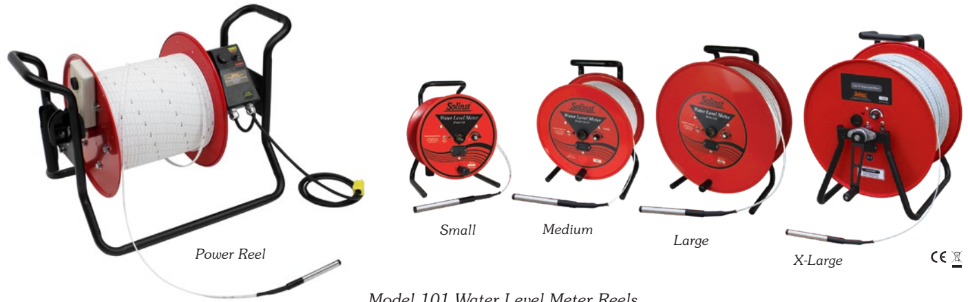
Model 101 Water Level Meter Reels