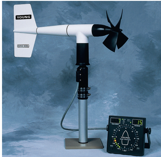
Wind Tracker pictured with Wind Monitor – MA

4-20 mA inputs, Serial NMEA, and Voltage outputs are standard on the Marine Wind Tracker. Alarms for both wind speed and wind direction are included.